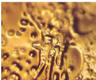
You make me sick, I will kill you

Water crystal structure of Negative words / thoughts / emotions