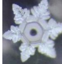
Tap water after prayer

Negative words, thoughts and emotions create chaotic molecules. This blocks the flow of oxygen at the cellular level in the human body. Positive words, thoughts, emotions, prayer vibrations, classical, serene music or the V 3 O charge organizes molecules in the body.